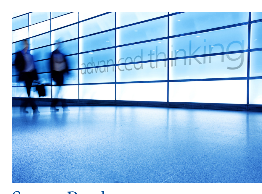
Smart Borders Increasing security without sacrificing mobility